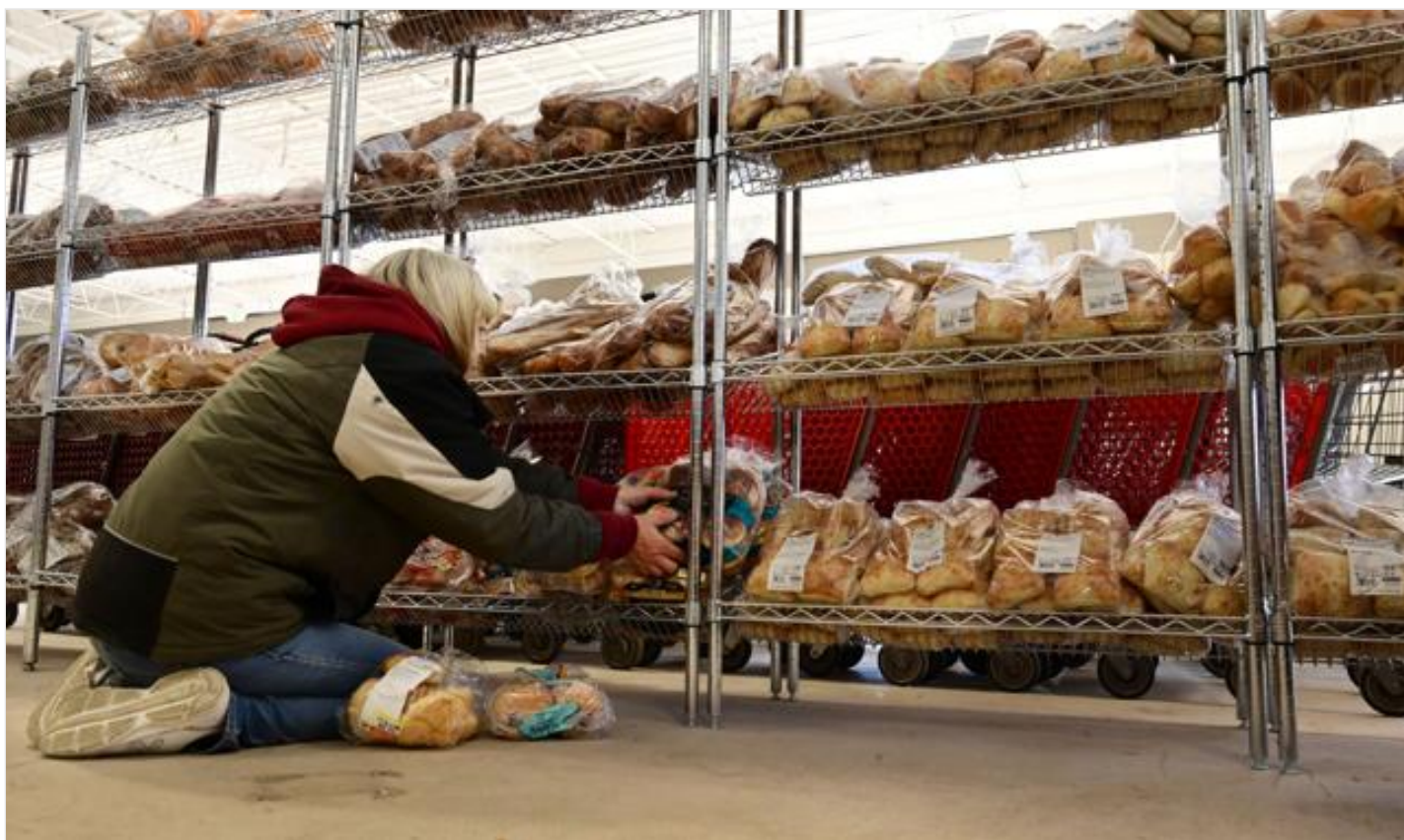
Colorado Springs' largest food pantry relocates, expands operations